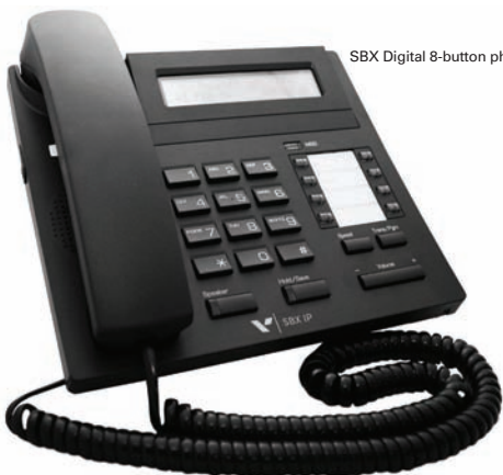
SBX Digital 8-button phone

It's easy to use, too. You empower employees to use its range of phone and voice mail features thanks to an easy navigation pad and LCD feature menus. Ultimately, the SBX IP lets you focus on running your business, not your telecom system.